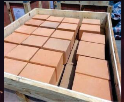
Brick Materials Refractory