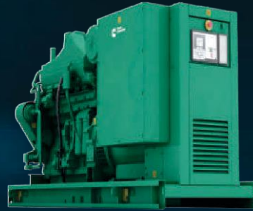
315 & 5750KW Gas