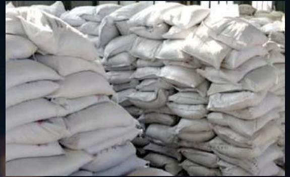
Raw Materials Refractory