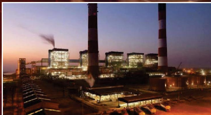
The Whole Power Plant Design Installation