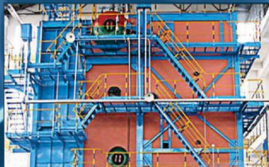
Chain Grate boiler