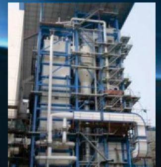
Circulating Fluidized Bed boiler