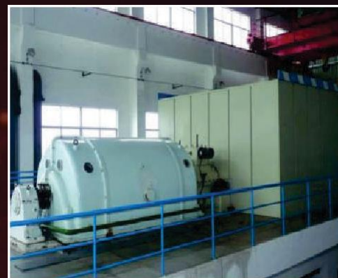
Steam Turbine and Generator Design Installation