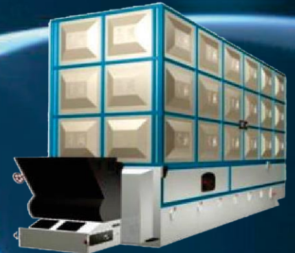
1-15T/H coal Heat transfer oil