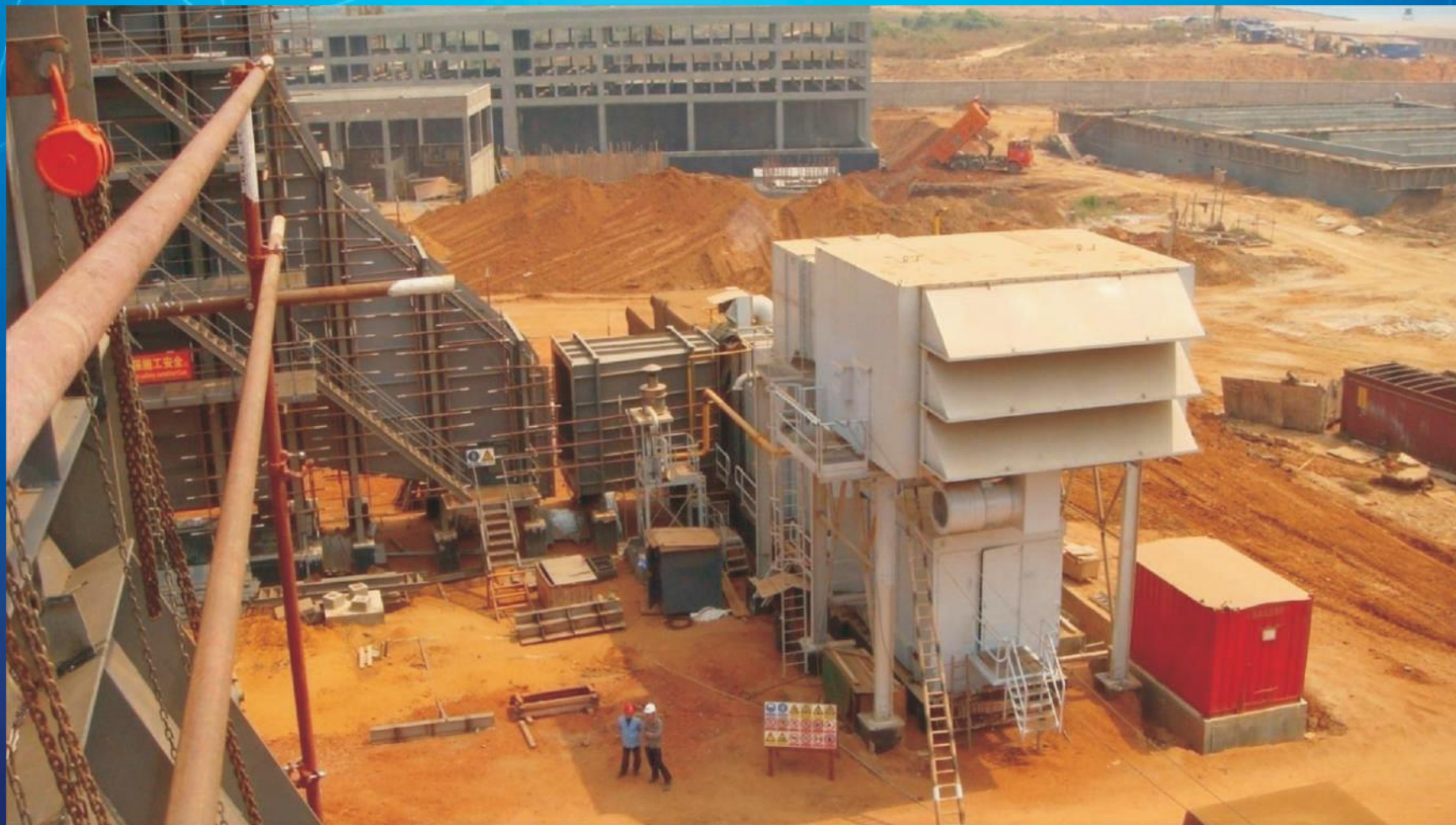
4 x 6B Sunon Asogli ( From China move to Ghana ) Project