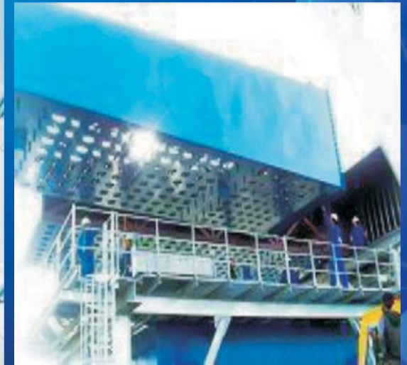
Indonesia LOT2 SUMUT Gas Turbine Power Plant Installation Project